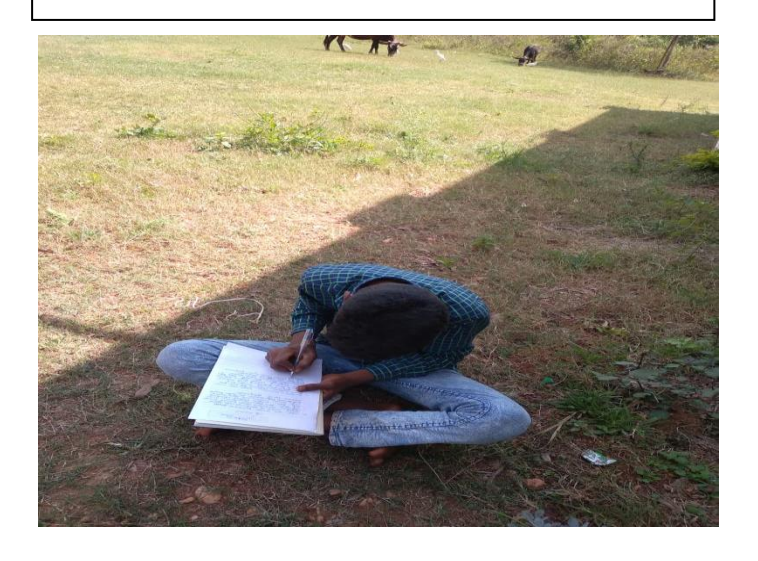
Essay Writing for Eco-club students on Human Rights