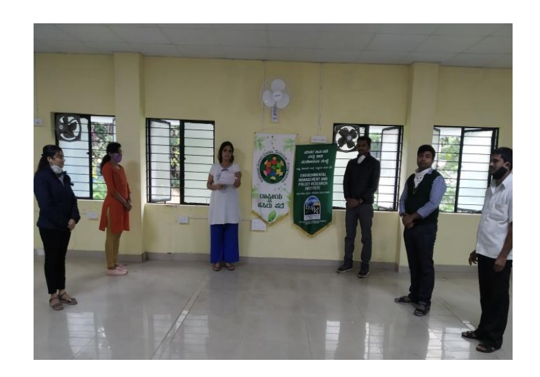
Constitution day preamble oath by EMPRI staff