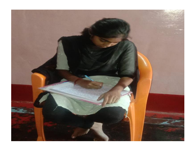
Essay Writing for Eco-club students on Human Rights