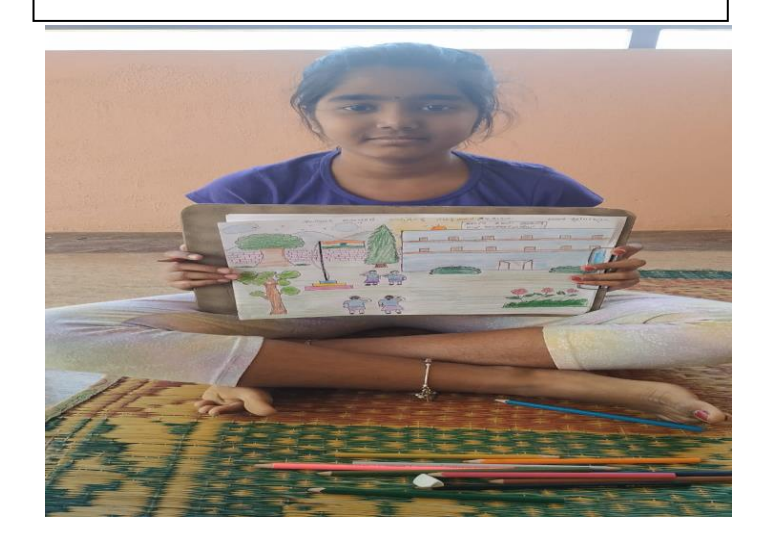
Drawing competition for Eco-club students