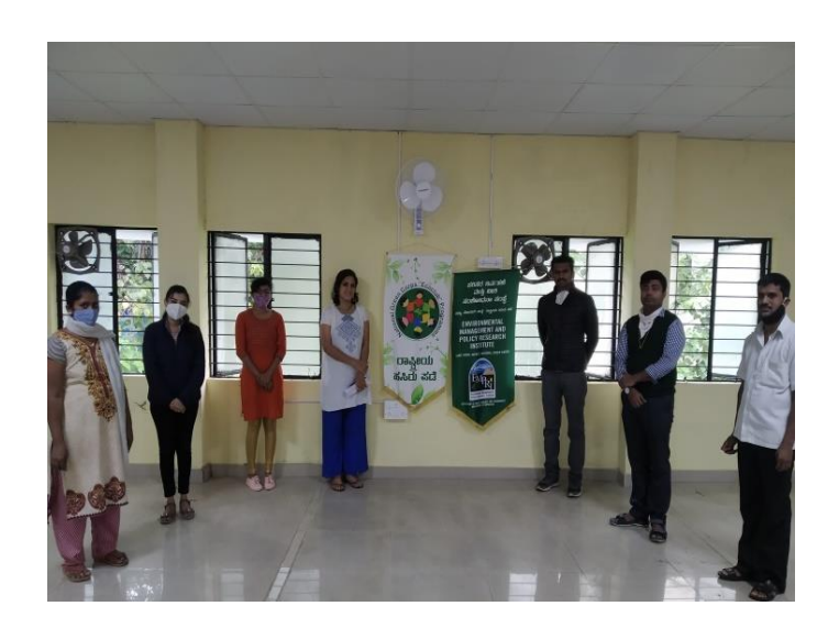
Constitution day preamble oath by EMPRI staff